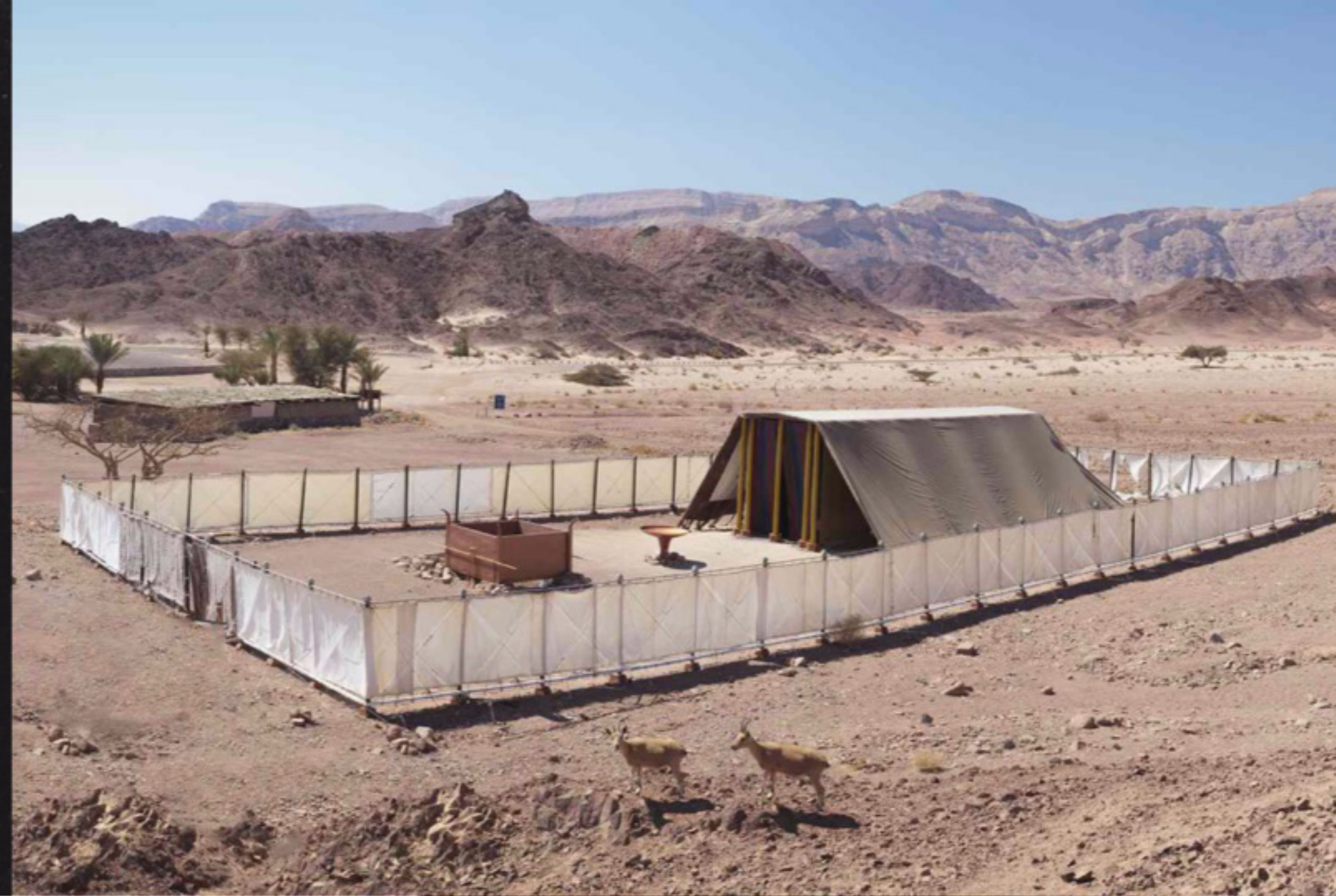
THE TABERNACLE OF MOSES (EXODUS 35-40)